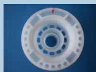
dip tube thread S62