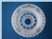
dip tube thread S62